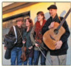
Burning Bridget Cleary